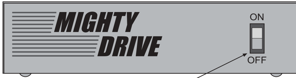
MAIN POWER SWITCH