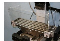
Optional Splash Guard