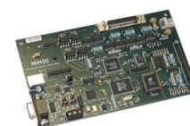
Advanced USB Controller with Feed Rate Override