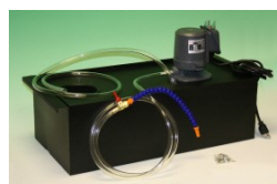
Optional Flood Coolant System